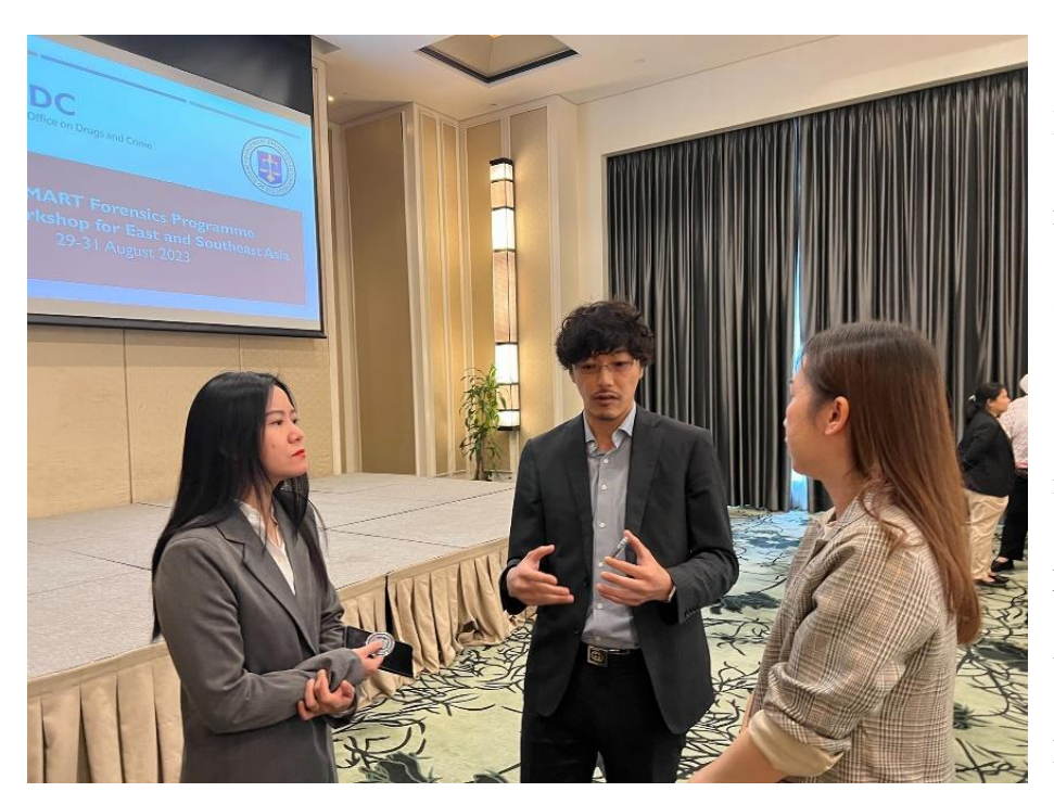
Participants discussed forensic drug analysis

"The drug situation in the Philippines has exacerbated in recent years and our law enforcement agencies have seized increasing amounts of methamphetamine year on year, predominantly produced from the Golden Triangle. We also have drugs entering the local market from other regions as