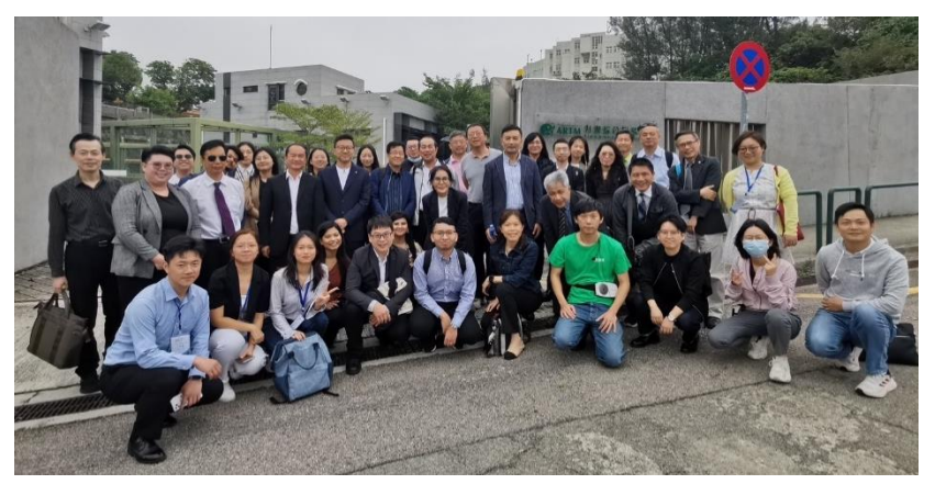
Group photo taken at the entrance of the Ka Ho Integrated Service Center.

We then engaged in an in-depth visit to the Smart-Youth, Christian New Fellowship in Macau. The organization added a department titled "Smart-Youth" in 2003, and officially adopted the name Smart-Youth in March 2009. Smart-Youth is dedicated to assisting and counseling adolescents who abuse or are dependent on drugs, helping them overcome their addictions. Smart-Youth aims not only to help them understand the effects of drug use on their bodies but also to guide them in seeking the meaning of life. During this trip, we explored the treatment models and prevention efforts that aid in the social reintegration of individuals